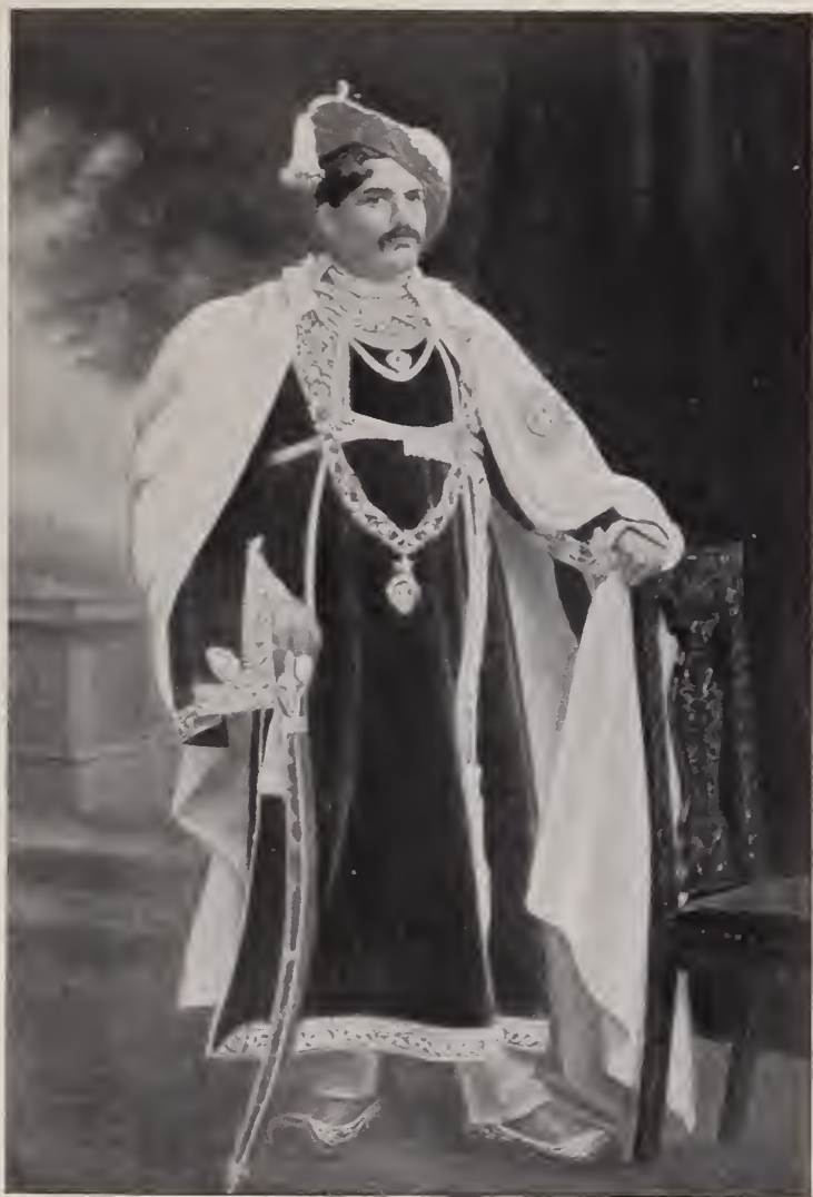
His Highness the Maharaja of Kolhapur, G.C.S.I., G.C.I.E. G.C.V.O., LL.D.